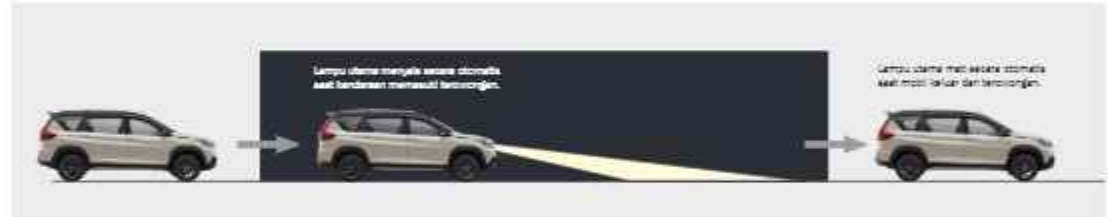
AUTOLIGHT WITH GUIDE ME LIGHT**

Buat pengalaman berkendara tetap seru namun nyaman dan aman melalui sistem keamanan terkini yang tersedia pada semua varian.